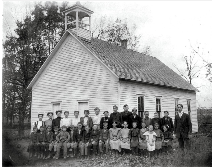
Harrell Schoolhouse - 1905