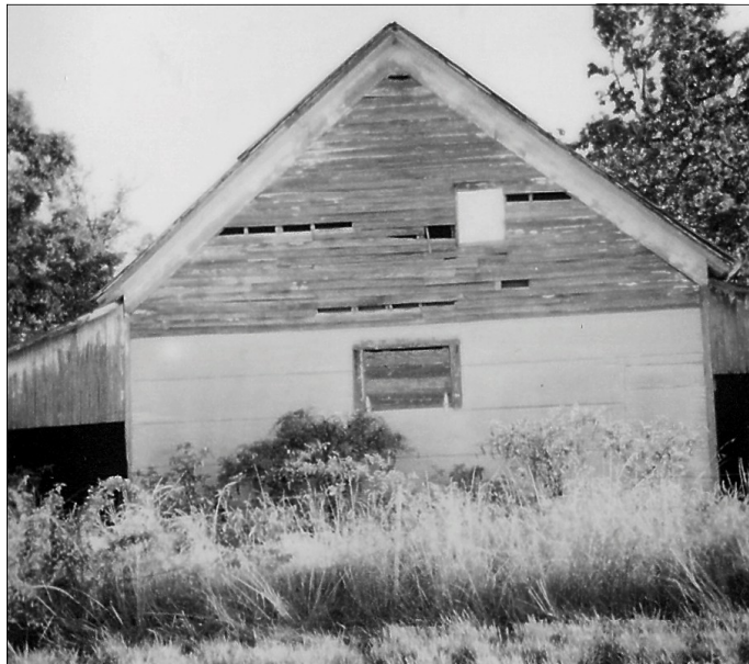
Harrell Schoolhouse - August 2005