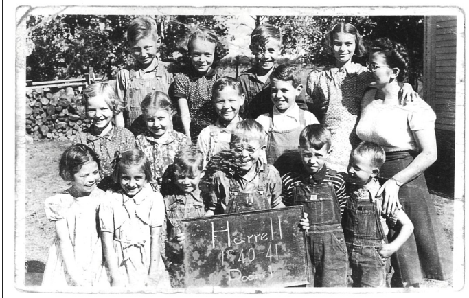
Harrell School 1940-41

Admission to the Museum has been and will continue to be free, however a membership program will be initiated in 2010. Along with the satisfaction of knowing you are helping preserve Barry County history, members will receive a 10% discount on purchases in our gift shop and FREE copies of future editions of Barry County Reflections newsletters. Levels of membership will be: